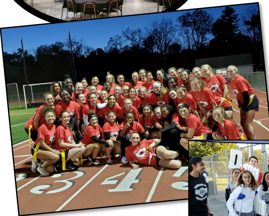
The senior girls' team won the Garter Bowl. (above)