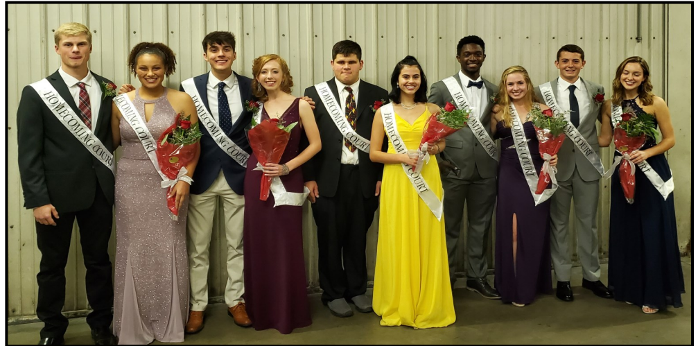
The 2019 Homecoming Court poses for a photo before the Friday evening football game. (above)