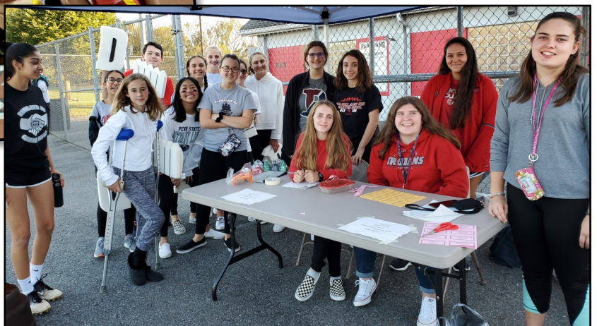
Student Council members work together at the Garter Bowl. (right)