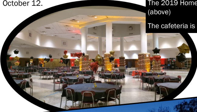
The cafeteria is decorated and ready for the Homecoming Dance on Saturday evening. (left)